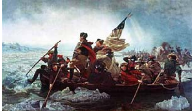
The Delaware Crossing

“After long hours of planning it was decided that the American Army would do something they had not done before - they would attack!”