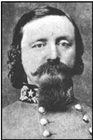
General George E. Pickett

"Longstreet's continued friendship protected his comrade."