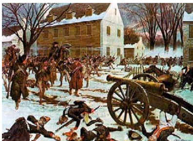
The Streets of Trenton